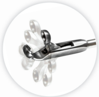
360° Fully Rotatable Shaft